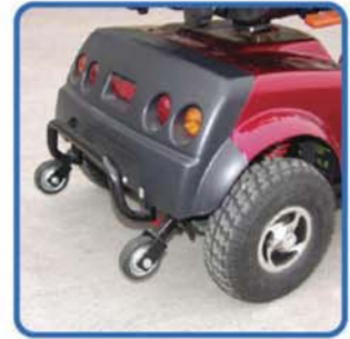
Rear nudge bar, tail lights and indicators