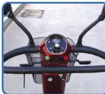
On/Off key, forward and reverse controls, power setting, battery power indicator, horn