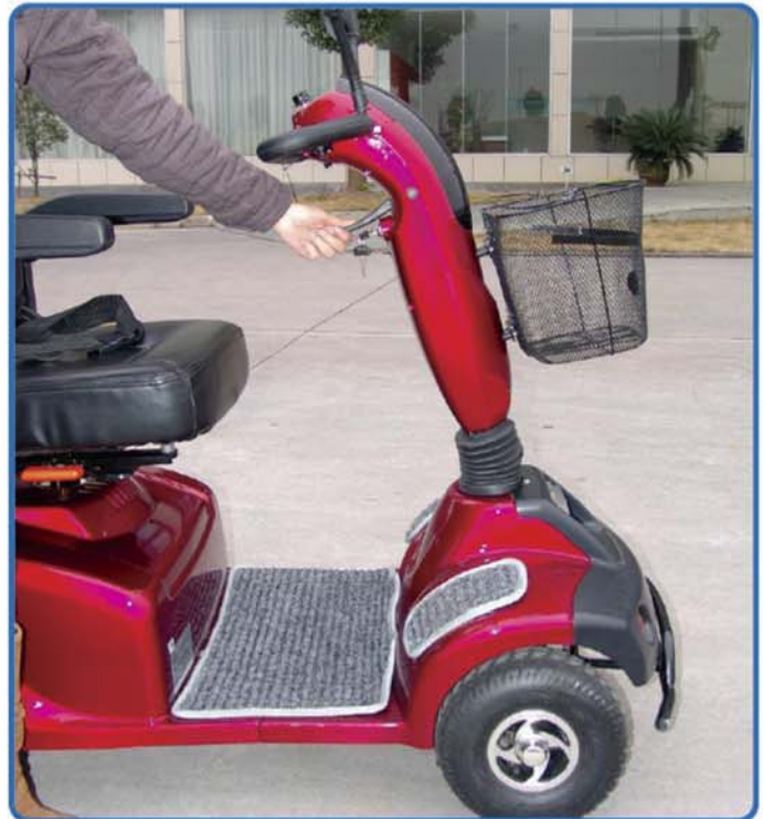
Easy tilt / adjustable steering position