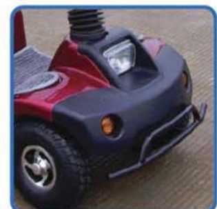
Powerful headlight, front indicators and front nudge bar