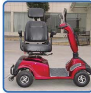
Easy swivel seat with headrest and flip up armrests