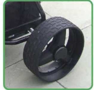
Strong quick release wheels