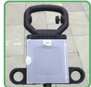
Easy speed control, ball and card holders.