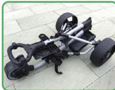
The Challenger Pro folds flat in seconds for easy transport and storage, wheels quick release for an even smaller pack size.