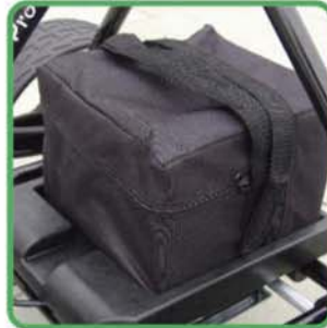
Heavy duty battery and easy carry battery bag