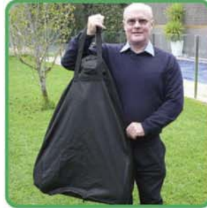
Challenger Pro fits neatly inside its handy carry bag (optional)