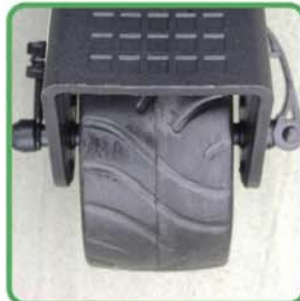
Front wheel with tracking adjustment