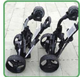
Challenger Pro's – ready for work