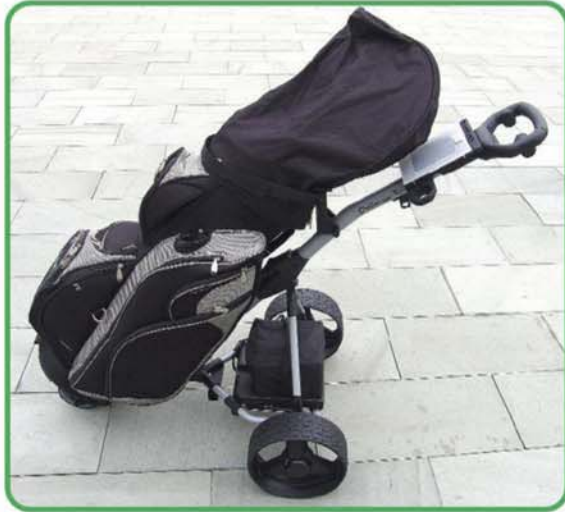
Challenger Pro – also available in silver

The Challenger Pro is manufactured in a quality assured environment, by one of the largest electric vehicle companies in the world. The engineering design and quality control through manufacture and attention to detail are second to none.