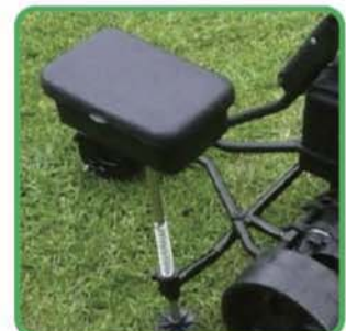
Challenger Pro – Optional Seat (flips open for storage)