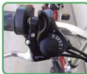
Shimano 6 speed gears