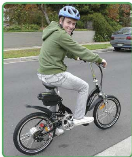
The Phoenix has that modern, sporty look with front and rear suspension to suit all riders and terrains.

The "Phoenix" has a similar range (40km PAS) as the other Cyclomatic models and comes with LED head lights and tail lights as standard. The "Phoenix" with front and rear suspension is the perfect commuter and can handle rough terrain and city commuting with ease.