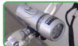
Large, bright tail light for added safety