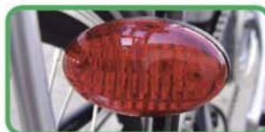
Powerful LED headlight