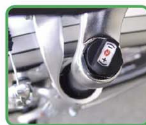
Adjustable front fork action to suit any rider or terrain.