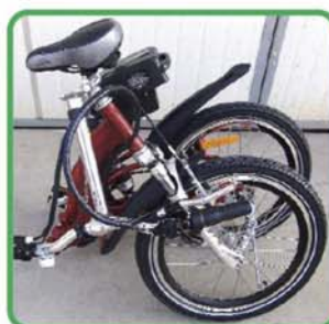
The Phoenix folds down fast and compact