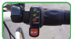
Battery power indicator and Shimano gear change