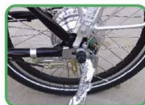
Side stand and powerful DC drive motor