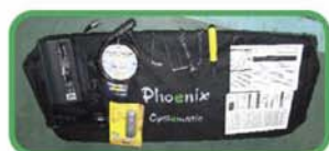
Tool kit and owners manual