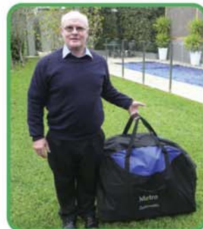
Convenient padded carry bag for security, travel and storage (optional)

All of the Cyclomatic models are made using the highest quality materials and workmanship incorporating the latest technology. They are certified to international quality standards and are CE certified. The Cyclomatic range of electric bicycles are manufactured by a world leader in electric vehicles; including electric cars, resort vehicles, mobility vehicles and other electric driven products. These vehicles are widely distributed in Europe, U.S.A. and other international markets. The production environment, attention to design and quality control are second to none. When choosing a Cyclomatic electric vehicle, you can be assured of the highest quality and performance available.