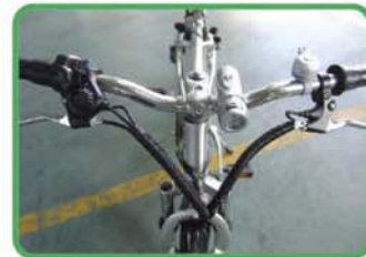
Headlight, Shimano gears, bell, powerful front and rear brakes.