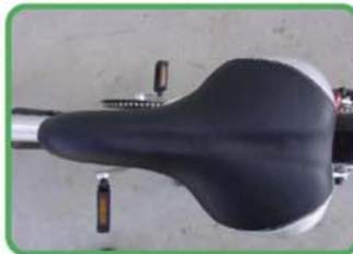
Soft ergonomically designed seat, pedal reflectors, rear tail light.