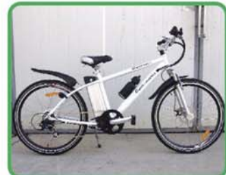
The Cyclone is available in black, white, red and silver.

All the Cyclomatic bicycles come with electric LED head lights and tail lights and standard reflectors for maximum visibility if you get caught out late.