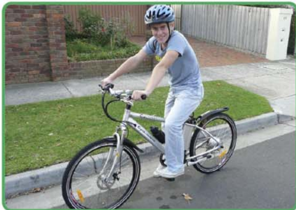
Cyclomatic Cyclone. All-alloy frame, front disc brakes, 26"x1.75" dual wall alloy wheels, drink bottle, reflectors, mud flaps, front & rear lights

The powerful lithium battery can be released in seconds. It is locked in place with a quality key to avoid unauthorised removal. The battery can be removed for charging or charged while on the bicycle.